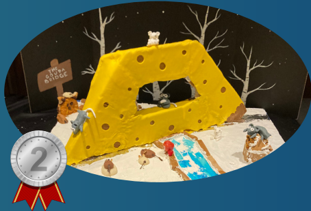
Green Mountain Area Homeschoolers