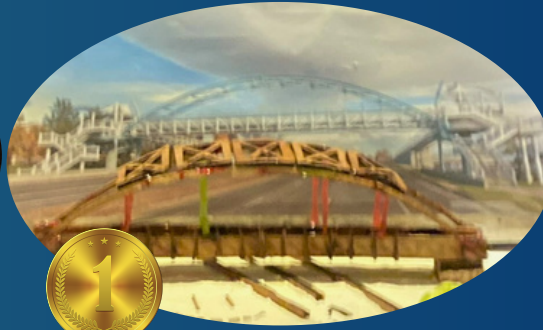
Dakota Ridge High School